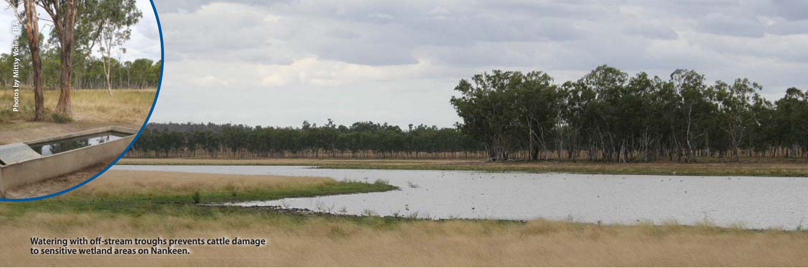
Watering with off-stream troughs prevents cattle damage to sensitive wetland areas on Nankeen.