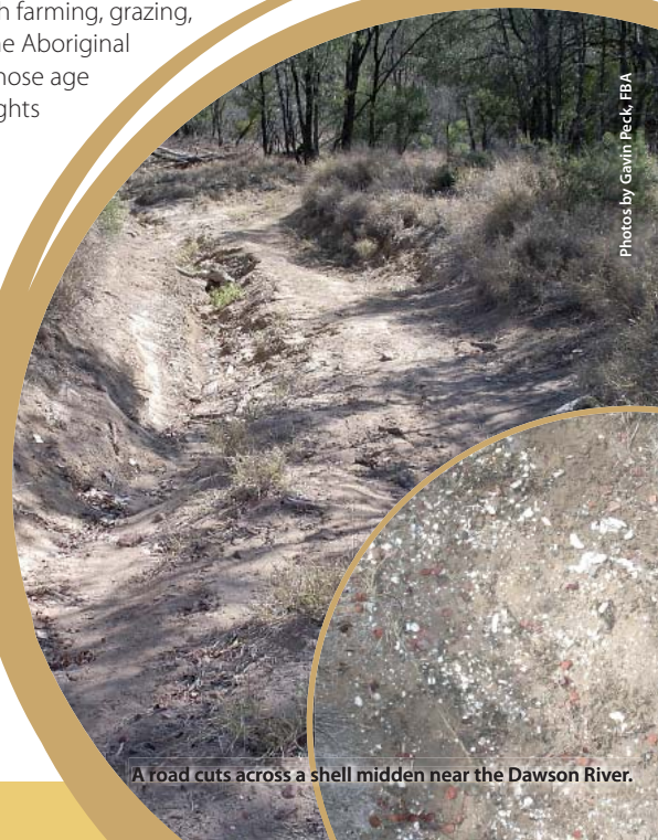
A road cuts across a shell midden near the Dawson River.